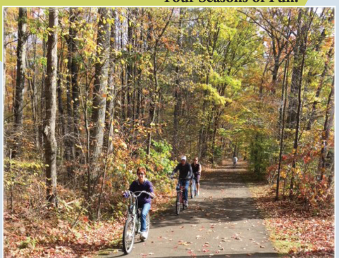
Special Events held along the trail throughout the year.